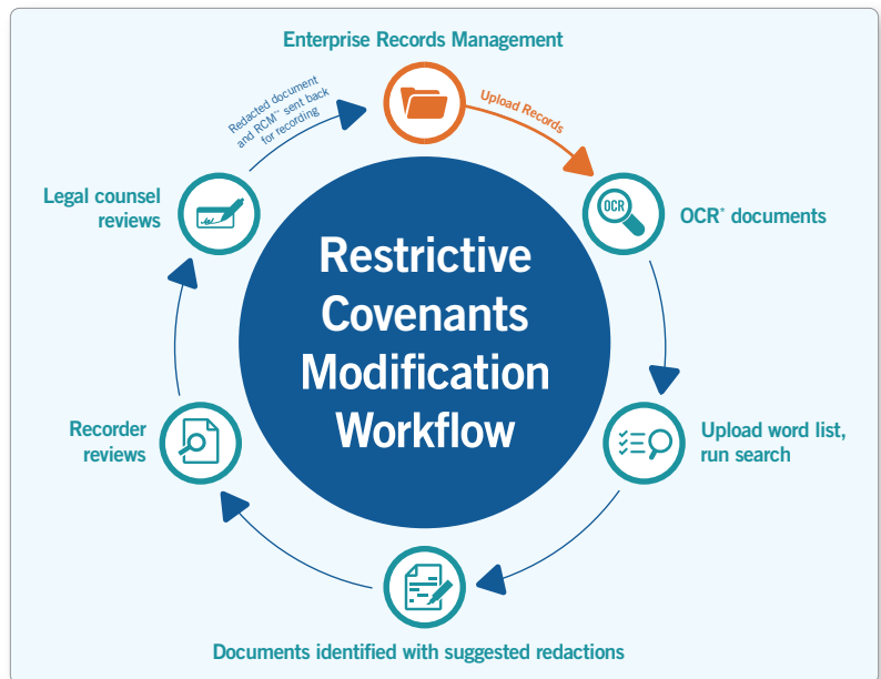
Advanced Records Processing Workflow